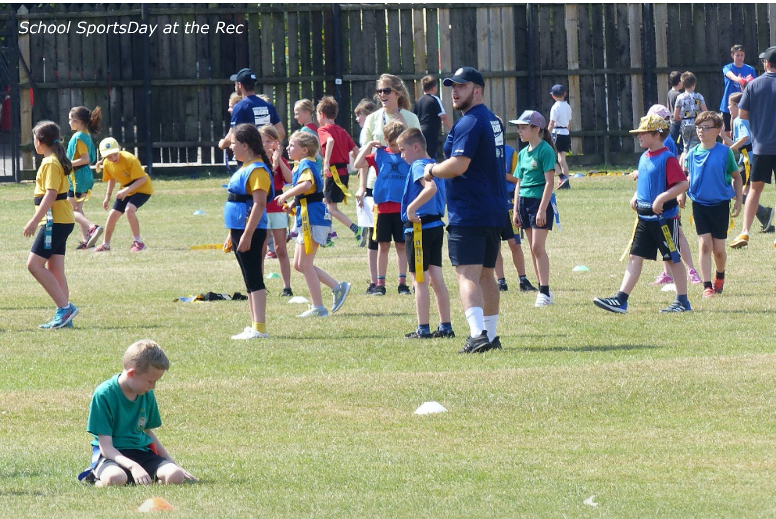
School SportsDay at the Rec

Our brand is all about nurturing positive lifestyles, and much of our charity work is focused on the younger generation, particularly the Glasshouse Academy and Glasshouse Academy Buds programmes. We are nurturing the next generation to give them opportunities and a level playing field, so that they can have positive experiences and to enable them to become role models for the future.