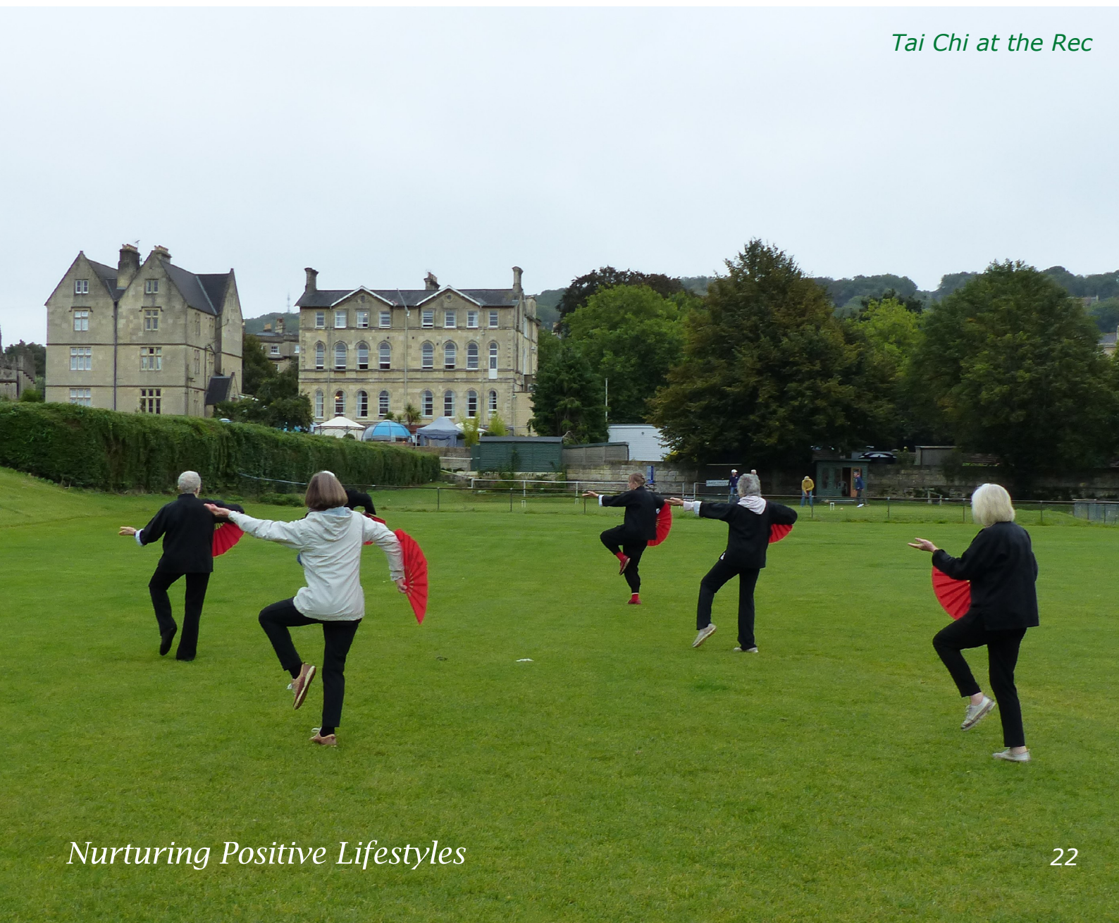
Tai Chi at the Rec

While we continue to support the longstanding activities on the Recreation Ground our charity is always seeking to grow new activities and events.